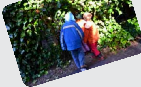
Exploring Our New Home

Our children's group has been growing. Thanks to all those who spread the Word about our center. We are looking for more volunteer teachers. If you'd like to spend some time with these wonderful children, call me. You will receive half-price on an accredited class for the month you have volunteered, plus a free CD of the service.