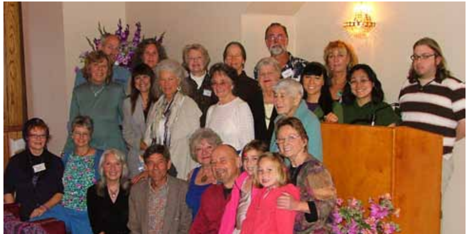
Pictured are some of the many volunteers and staff who enrich our MCSL Community